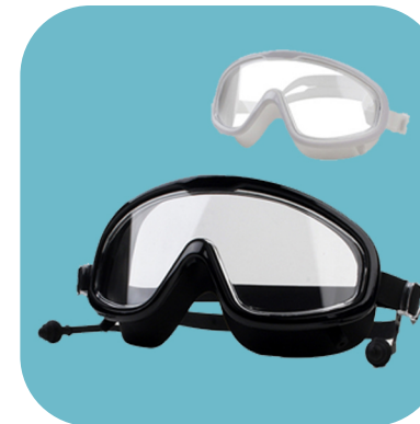
HG-W or B eyes mask