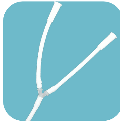
Y-L long Y tube