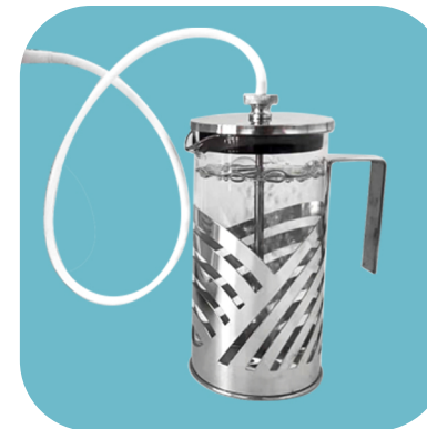
HP-A hydrogen water pot