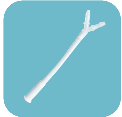
Y-S short Y tube