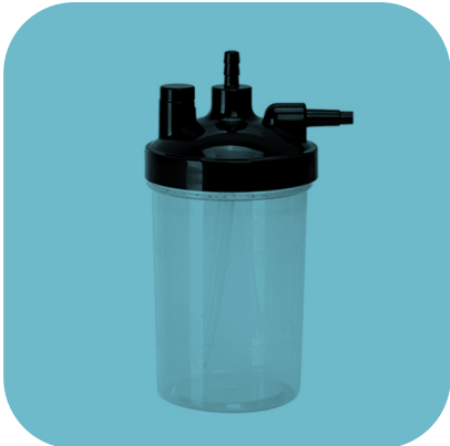
J-D water collection bottle