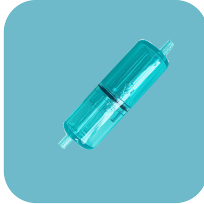
J-B water collect container