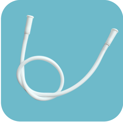
TS straight tube