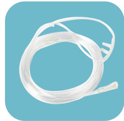
NC-D disposable nasal cannula