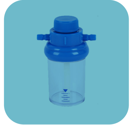
J-C water collection bottle