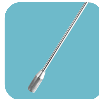
HR-A hydrogen rod