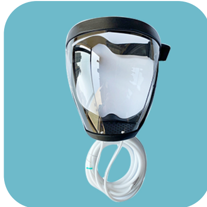
HM-A hydrogen mask