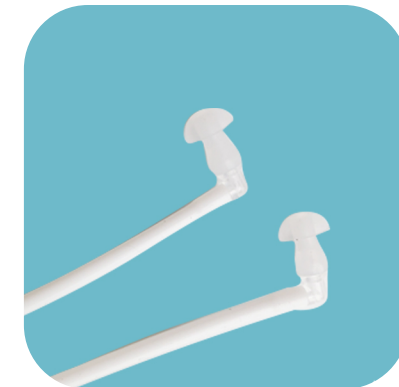
HE-A ear accesstory