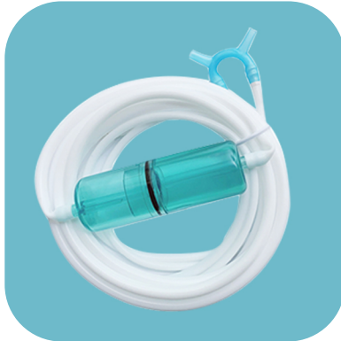
NC-A silicone nasal cannula