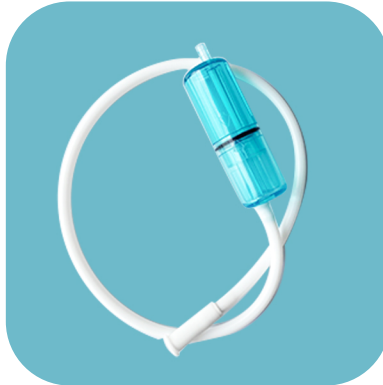
J-A water collect container