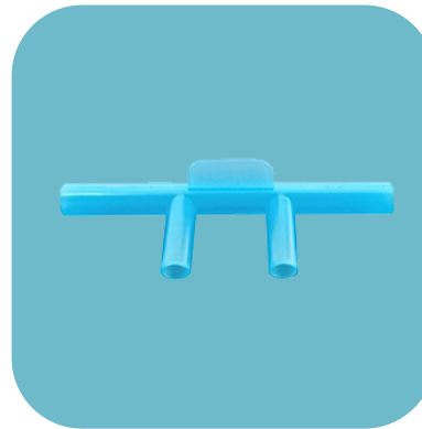
NC-N nose accessory