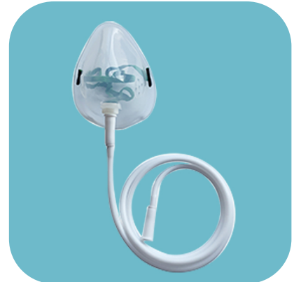
HM-B hydrogen mask